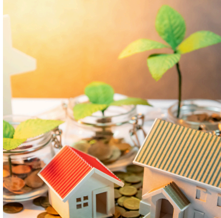
Savings and Investment