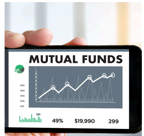
Classifications of mutual funds