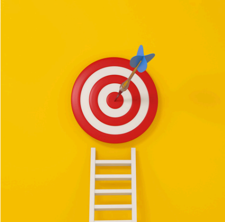
Financial Goal Setting